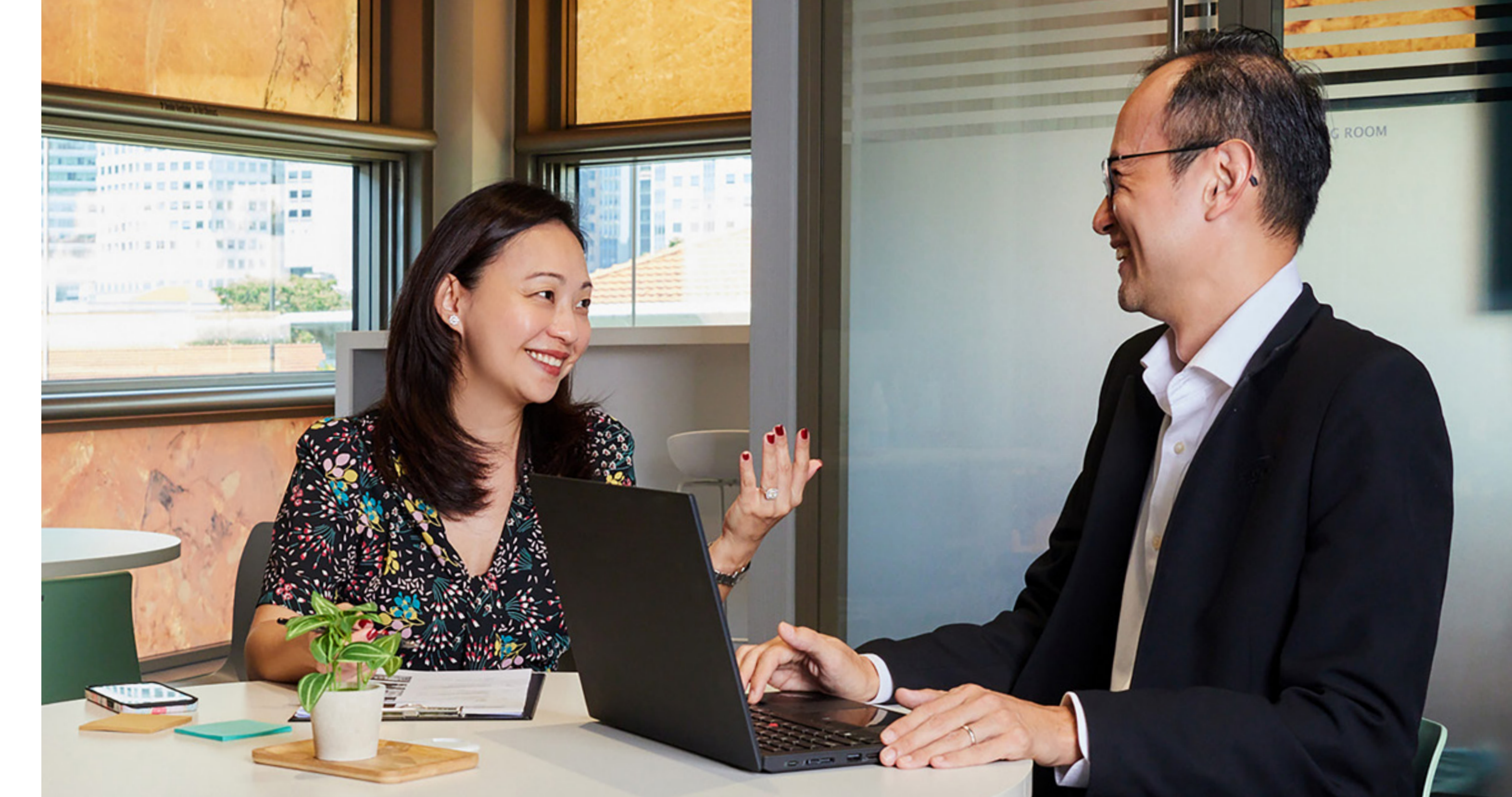
Learning from one another allows SG Courts staff to gain new knowledge and skills that they can integrate into their work.

Supreme Court registrars also contribute to the development of international instruments such as conventions and model laws. As members of the Singapore delegations to working groups of the United Nations Commission on International Trade Law (UNCITRAL) and the Hague Conference on Private International Law (HCCH), they have provided technical assistance and substantive inputs on draft instruments.